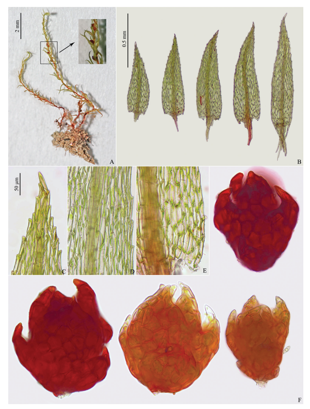
Figure 2. Light micrographs of Pohlia tibetana . A plants B leaves C apical laminal cells D median laminal cells E proximal laminal cells F gemmae. from the holotype (BAU!).

P.tibetana differs from P.filum by its yellowish brown or deep cherry-red, <300 \mu m long (vs. orange or black and >300 \mu m long) gemmae and arising at apex as well as below, the same color as the body, incurved (vs. arising only in the apex, green to pale, erect) leaf primordia.